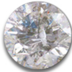
Low Quality Diamonds: commercial cut, opaque and dull return of light.