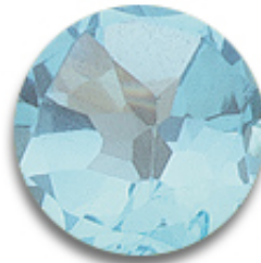
Low Quality Swiss Blue Topaz: very pale color, poorly cut.