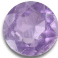
Low Quality Amethyst: pale color, poor cut visible inclusions