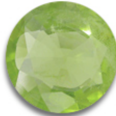
Low Quality Peridot : pale green color, mined outside the U.S.