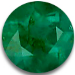
High Quality Emerald: 57 facet cut, intense green color, transparency