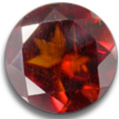
High Quality Garnet: intense red color with hints of orange and yellow

High quality garnets are prized for their clarity and depth of color.