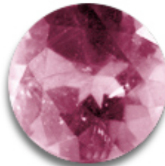
Low Quality Tourmaline: dirty pink or mixed colors.