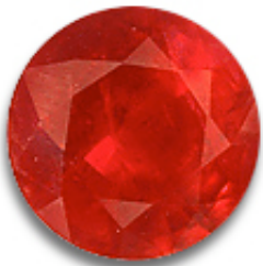
High Quality Ruby: 57 facet cut, intense red color

The secret to a Ruby is it's color: look for a deep, intense red with sparks of fire within the gemstone. It costs a little more, but the difference is well worth the price.