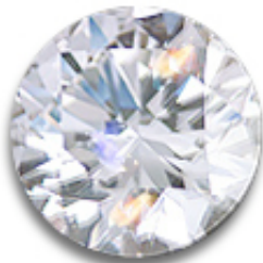
High Quality Diamond: superior return of light, 57 facet cut, extraordinary fire and scintillation.

Diamonds are perhaps the most difficult gemstones to judge quality versus price. The secret to a diamond is its cut. An excellent cut diamond will display an incredible fire and brilliance, a shower of sparks that can be seen from far across a dimly lit room. Most commercial grade diamonds are "poor" or "fair" cut, while our comparable diamonds are "good" or "excellent" cut. We charge considerably less for our better cut grades to assure you extraordinary quality.