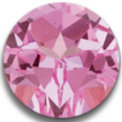
High Quality Tourmaline: pure pink color with no interior flaws.

Our pink tourmaline is a bright pink, cut with precision to emphasize the interior highlights.