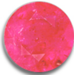
Low Quality Ruby: lower quality cut pale pink-red color