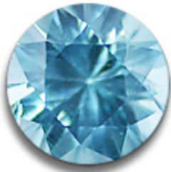
High Quality Swiss Blue Topaz: intense, deep blue color with good clarity

More common Swiss Blue Topaz tend to be light blue in color and poorly cut.