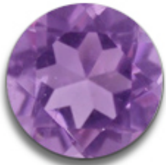
High Quality Amethyst: precision cut, intense purple color, transparency