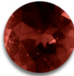
Low Quality Garnet: dark color, opaque, lacks fire from within stone