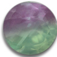
Low Quality Alexandrite: displays lackluster inferior hues at about 4 times the price.