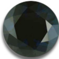
Low Quality Sapphire: intrinsic dull dark color, lower quality cut inferior symmetry