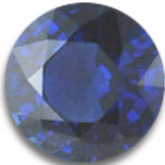
High Quality Sapphire: intense blue color 57 facet cut, deep hues of fire within

Our Sapphire are hand-selected for color and cut with a full 57 facets, and command a slightly higher price.