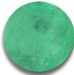
Low Quality Emerald: pale color, lower quality cut inferior symmetry