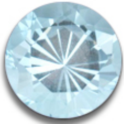
High Quality Sky Blue Topaz: delicate sky blue color with good clarity.

Our Genuine Aquamarine Gemstones are a delicate sky blue color with a glittering, transparent watery clarity. More common Aquamarines tend to be nearly white in color and poorly cut.