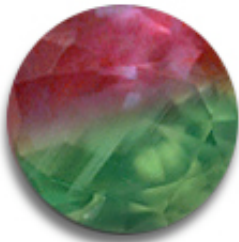
High Quality Alexandrite: displays the vivid red-green hues at about 1/4 the price of natural.

Superior quality Alexandrites are extremely rare, often commanding twice the price of comparable diamonds. To keep your mother's ring price within reason, we've chosen to offer Chatham Lab Created Alexandrites. These stones have the identical natural characteristics of Alexandrite, except they are lab cultured crystals Alexandrite is a unique "color change" gemstone and the Chatham variety displays superior tones. (You may order natural Alexandrite by special request).