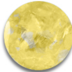
Low Quality Citrine : dull or lackluster due to poor cut.