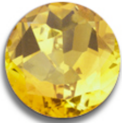
High Quality Citrine : light golden color with shimmering brilliance.