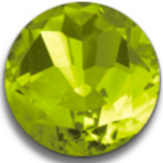
High Quality Peridot: bright yellow-green mined in Arizona